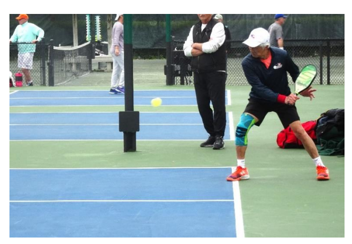
Playing and Competing