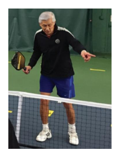
Teaching and Coaching