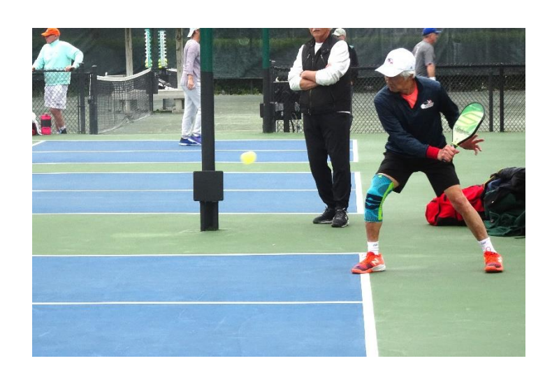
Playing and Competing