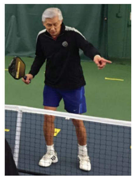
Teaching and Coaching